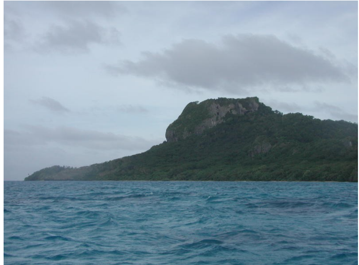
Lion's Lap on the Island of Naitauba, Fiji

Retreatants were getting used to receiving morning Darshans from their Beloved Heart Master when He returned from Lion's Lap where He had been spending nights. He would arrive by sport utility vehicle or boat and if it Pleas'd Him He would Offer the most sweetly intimate Darshans from either the outer courtyard or the veranda outside His bedroom. We were so fortunate; it Pleas'd Him to grant these Darshans almost every day.